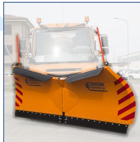
Working position 3 RIGHT BLADE