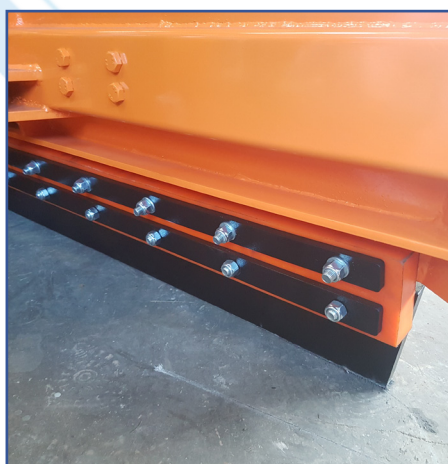
Anti-shock polyurethane bumpers system on the bottom cutting edges