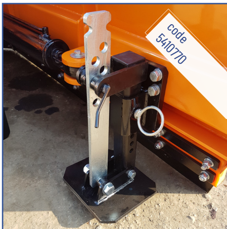
Pair of slides adjustable in height