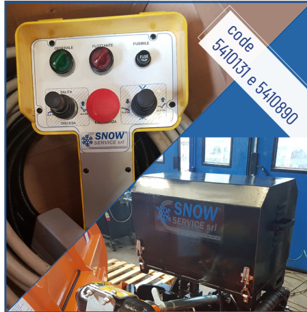
24V electro-hydraulic power (optional) unit equipped with cable and push-button panel (6+1 stations or 8+1 stations) to be matched with the code 5410910