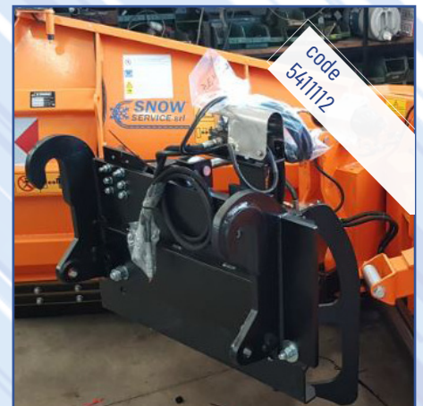
Attachment for operating machines (backhoes, loaders) to be bolted on the DIN plate