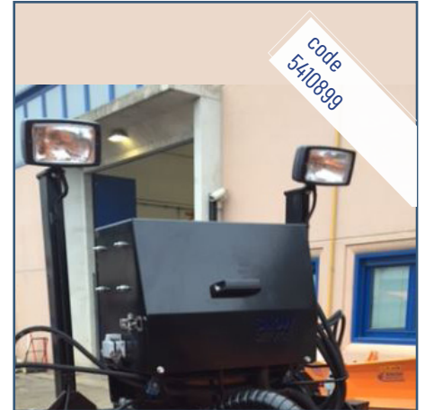
Pair of additional lights mounted on the DIN plate