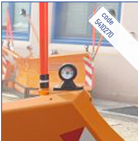
LED side-marker lights