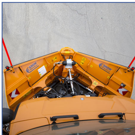
"V" position 45° working angle