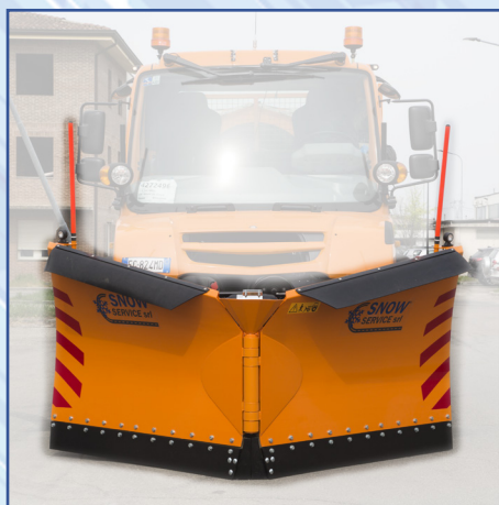
Working position 1 WEDGE-SHAPED/V MODE