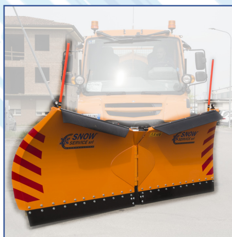
Working position 4 LEFT BLADE