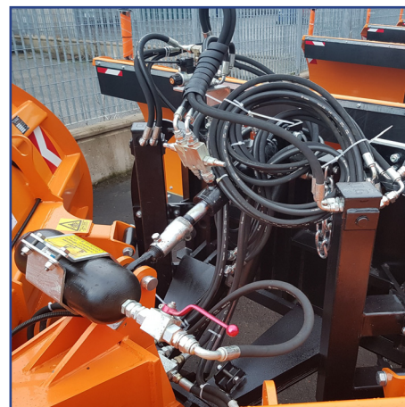
Nitrogen accumulator to reduce the side shock loading