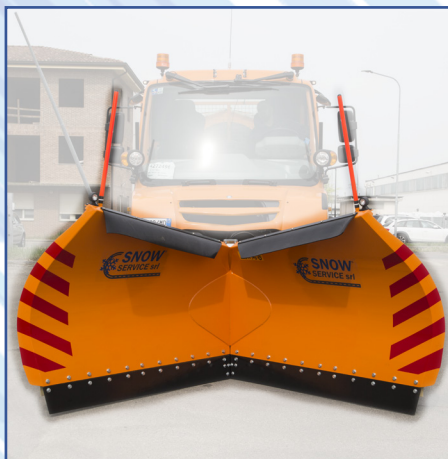
Working position 2 SCOOP MODE