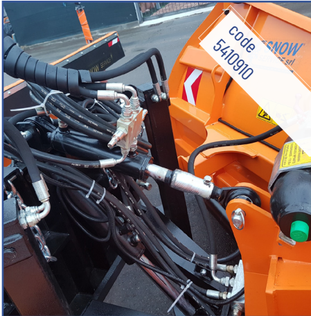
Double-effect hydraulic cylinder (optional) to manage the automatic adjustment and the front shock absorbing system (necessary a 4th hydraulic line)