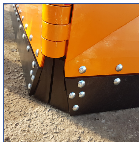
Anti-shock bumpers system on the tip