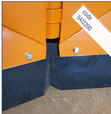
Rubber cutting edges (250x50)