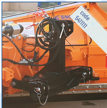
3-point hitch forklift attachment to be bolted on the DIN plate