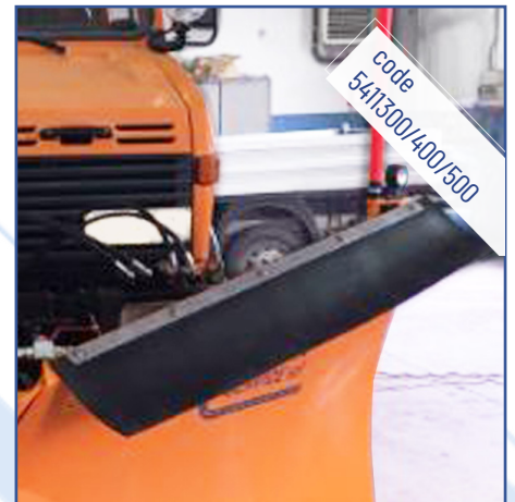
Upper rubber splashguard (optional)