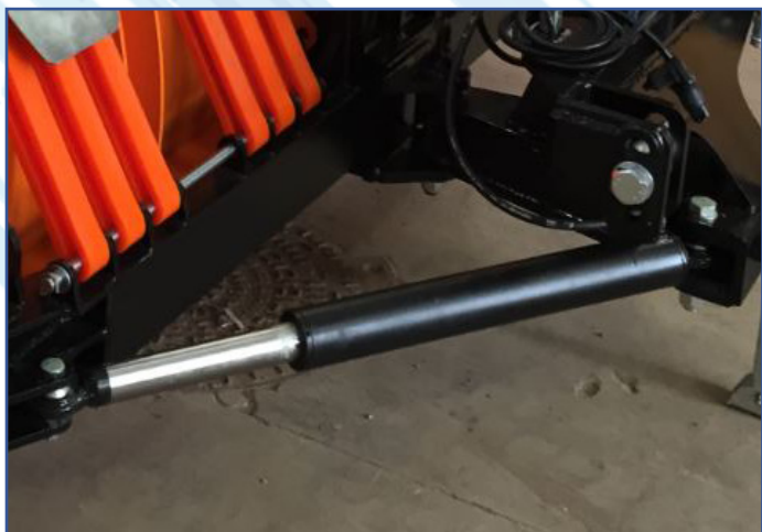
Hydraulic orientation with single-acting cylinders