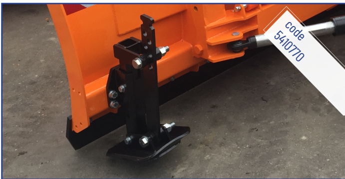
Pair of adjustable in height slides