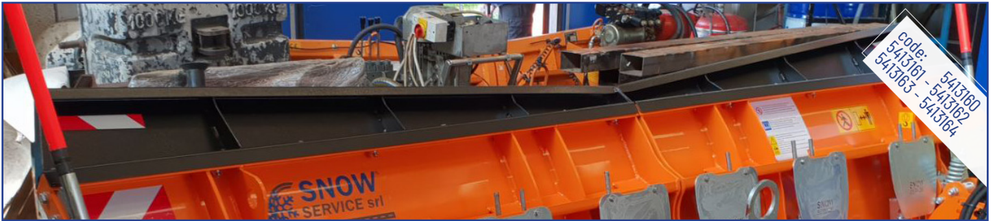
"V"- shaped steel upper extension