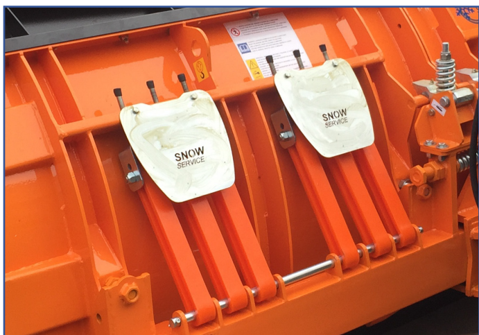
Polyurethane elastomers to prevent the snowplow from tipping over