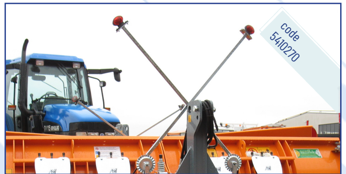
Expandable side-marker lights