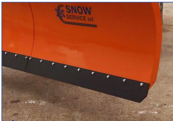
Cutting edge made of Hardox steel 500/Vulkollan (special polyurethane)