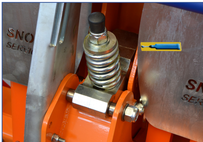
Retaining mechanical hooks to provide vibration protection