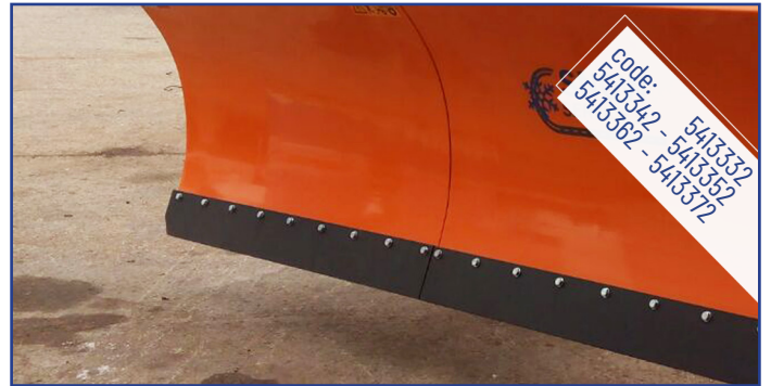
Neoprene cutting edges 240x30 mm