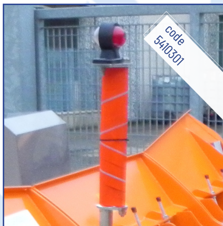
LED side-marker lights