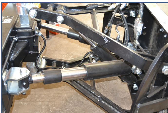
Double-acting hydraulic orientation cylinders