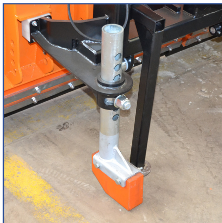
Adjustable Vulkollan (special polyurethane) slides