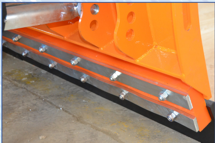
Lower bumpers to provide front vibration protection