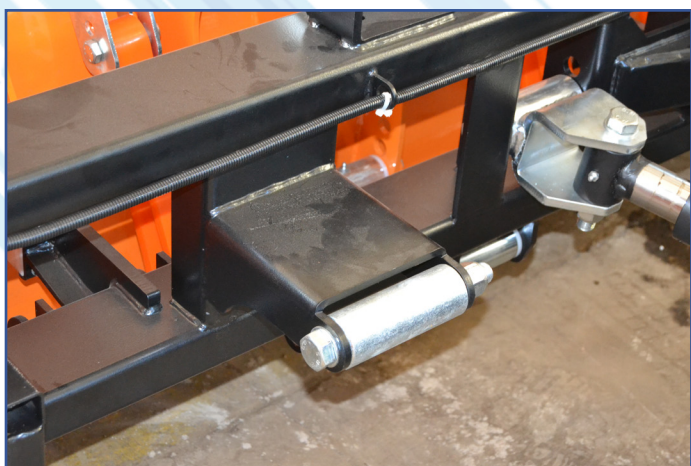
Side mechanical stops