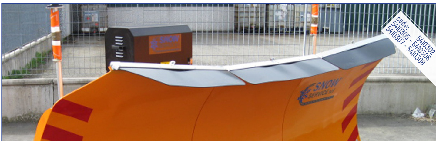
Rubber splashguard (optional)