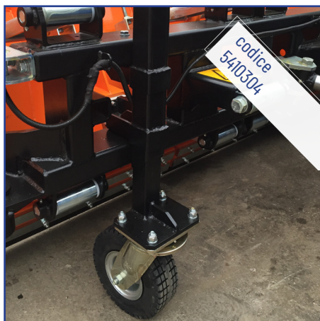
Pair of jointed and adjustable wheels