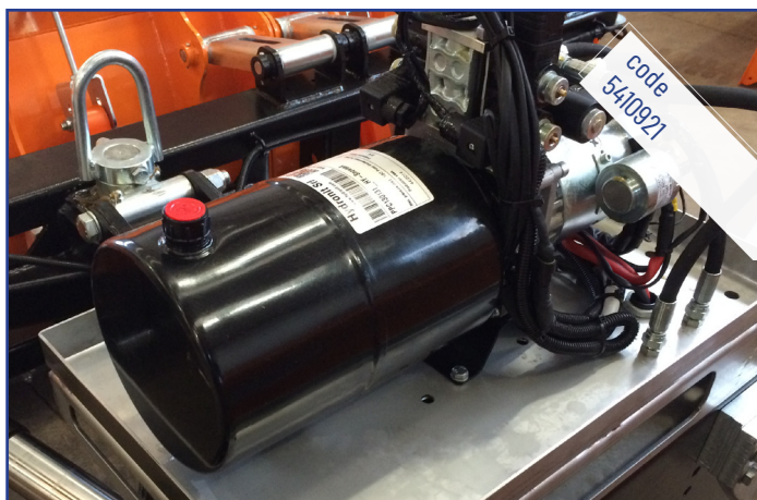
24V electro-hydraulic power (optional) unit equipped with cable and push-button panel