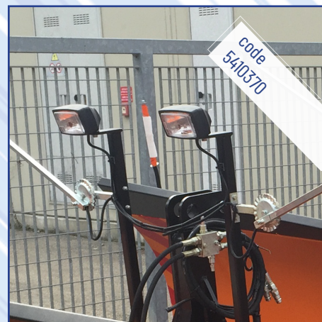
Pair of additional lights