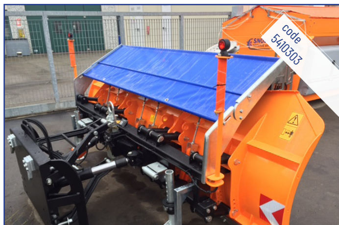
PVC tarpaulin cover with adjustable support